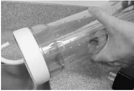
Figure 21—Draining the Unit